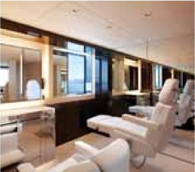
Top left: The sushi bar where the chef prepares oriental-inspired meals and canapes for the guests. Above left: Access around the exterior of Grace E is easy and uncluttered. Left: A hair and mani/pedi salon on the bridge deck is a very popular spot. Above: The bridge deck plays host to the main exterior dining table, as well as a sofa bench with built-in tray tables. Right: A large sofa and clean, modern lines on the bridge deck for informal relaxing and entertaining.