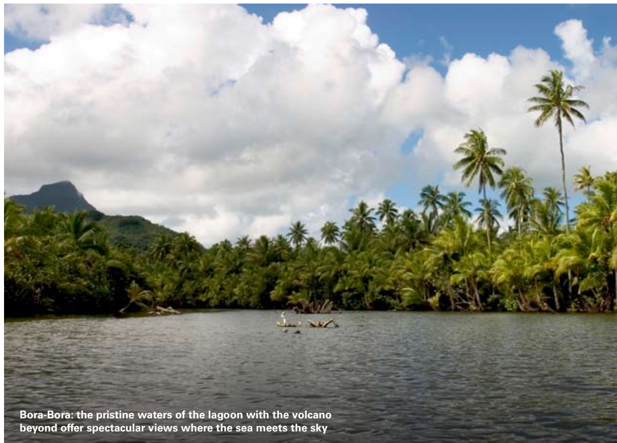
Bora-Bora: the pristine waters of the lagoon with the volcano beyond offer spectacular views where the sea meets the sky

The right choice of yacht for a given destination. Although the choice of destination, and being there at the right time of the year is paramount, it is important to ensure the vessel that takes you there is relevant both to your lifestyle and the place you're going. One should also be aware that there are places such as Bali or Easter Island that shouldn't be discovered by boat, due to the lack of pleasant harbors or good anchorages. And it is important to rely on someone, whether your captain or broker, who can help handle all the administrative difficulties and numerous regulations that otherwise can easily take the fun out of boating. I would also recommend for anyone keen to own or build a yacht to charter a number of different yachts first.