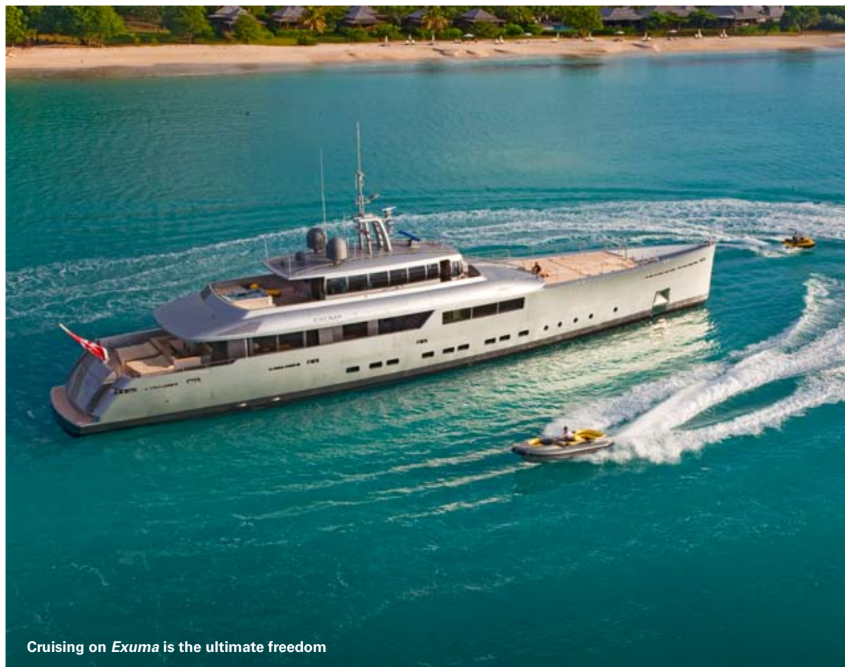
Cruising on Exuma is the ultimate freedom